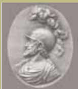
Ligue Henri IV